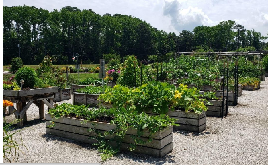
Raised Bed and Straw Bale Gardens